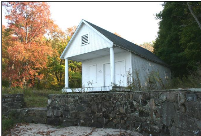
Boathouse built in 1914 on the south shore of Bantam Lake.

In 2000 the Connecticut Department of Environmental Protection acquired the former Camp Columbia. Camp Columbia, started by Columbia University, is the earliest field camp in a permanent location established for the purpose of providing practical experience to engineering students, primarily in surveying techniques. It operated from 1891 to 1965. The State of Connecticut purchased the 591-acre property for use as open space and outdoor recreation. The property includes numerous buildings and structures related to the camp operation, ranging from a stone observation/water tower, to dining, classroom, recreation and residence buildings, to a boathouse and icehouse on Bantam Lake. The SHPO determined that the Camp Columbia buildings are collectively eligible for the National Register of Historic Places. Most of the buildings are in poor condition and unsafe, thus they will be demolished. AHS was contracted to prepare a photographic and documentary record of each building and structure prior to the demolition of these significant historic resources. More than 130 photographs were taken and narrative text was prepared that gives a capsule history of the camp, its historic context, and its significance.