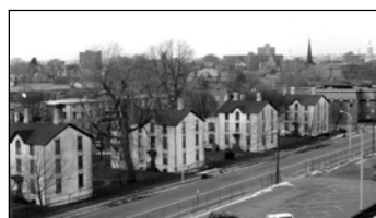
Colt worker houses on Huyshope Avenue.

materials necessary to have the district designated a Landmark. The documentation required a detailed site map, black-and-white photographs of historic resources in the district, reproductions of historic maps, engravings and photographs, a complete architectural description of the factory, houses, and other components of the district, and a lengthy statement explaining the national significance of the Colt company as embodied in the district's resources. Clouette participated in numerous local public-information meetings, gave media interviews, and presented the nomination to the National Landmarks Board in Washington.