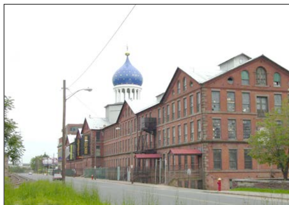
The Colt factory complex in Hartford.