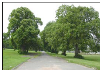
A remnant of an "allée" of American lindens in Colt Park marks a former carriage entrance to the Colt estate.