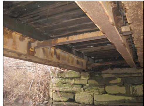
Former I-beam railroad bridge.

Because of the ground disturbance associated with the initial construction and subsequent maintenance of the rail line, the proposed trail bed was judged to have minimal potential for prehistoric and pre-railroad historic archaeological remains. Extreme erosion at the site of one of the new bridges also excluded any archaeological impacts from that action. The second bridge was to be located where an existing former rail bridge crossed a stream; the construction of the abutments for that bridge was assumed to have disturbed any archaeological remains. Adjacent fill and drainage engineering further compromised the site, so the construction of the new bridge was determined to have minimal potential to disturb significant archaeological resources.